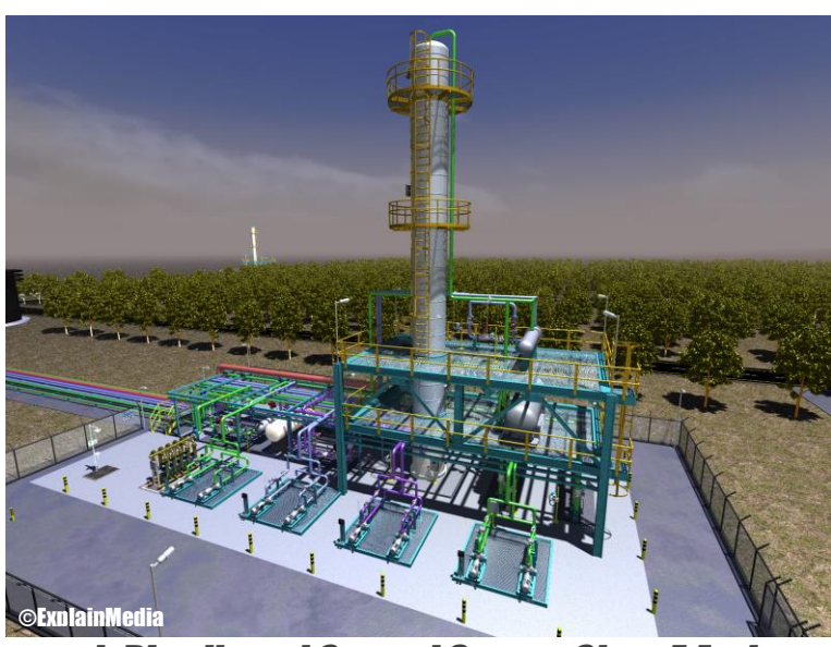
and Distributed Control Screen Cheme Action

A chemical engineering optimization and safety skills competition based on binary distillation combining Virtual Reality